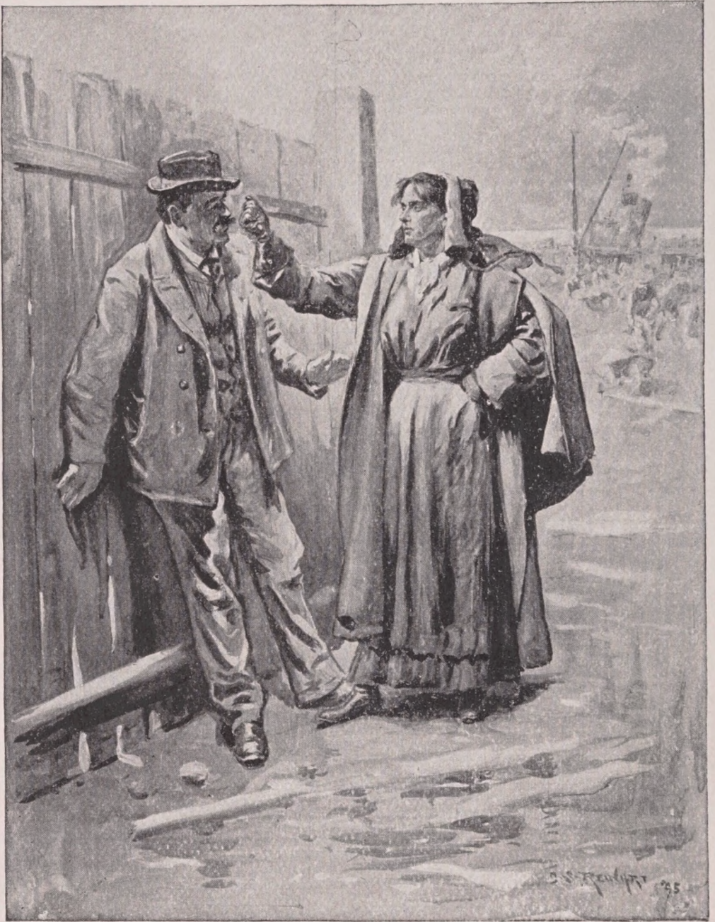
Lathers shrank back, cowering before her (page 31)